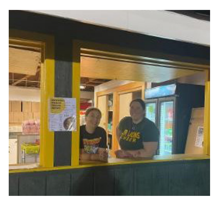
The North Hunterdon boosters were able to scramble and open the concession stand.

He made it all work, so that a crew could be present at North Hunterdon.