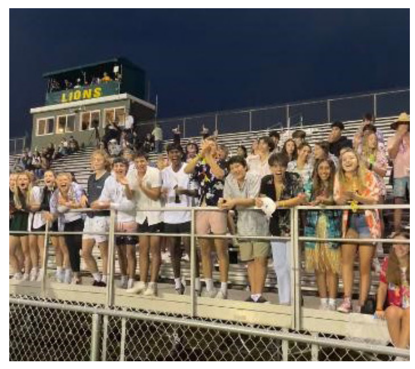
A group of North Hunterdon students found out about the switch and made it to the school to support their team.

Watchung Hills won the game, 49-6, but everyone had a night to remember. And for all of the adults involved, there was satisfaction in knowing that it was all successfully done for the sake of the student-athletes.