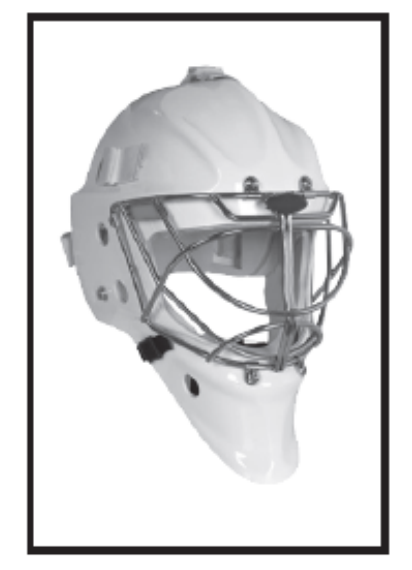
Cat-Eye Non-HECC certified