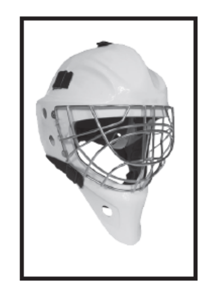
Cat-Eye HECC certified

These images serve as a guide to distinguish the difference in a HECC certified cat-eye goalkeeper mask and a non-HECC certified cat-eye goalkeeper mask. Learn more at hecc.net.