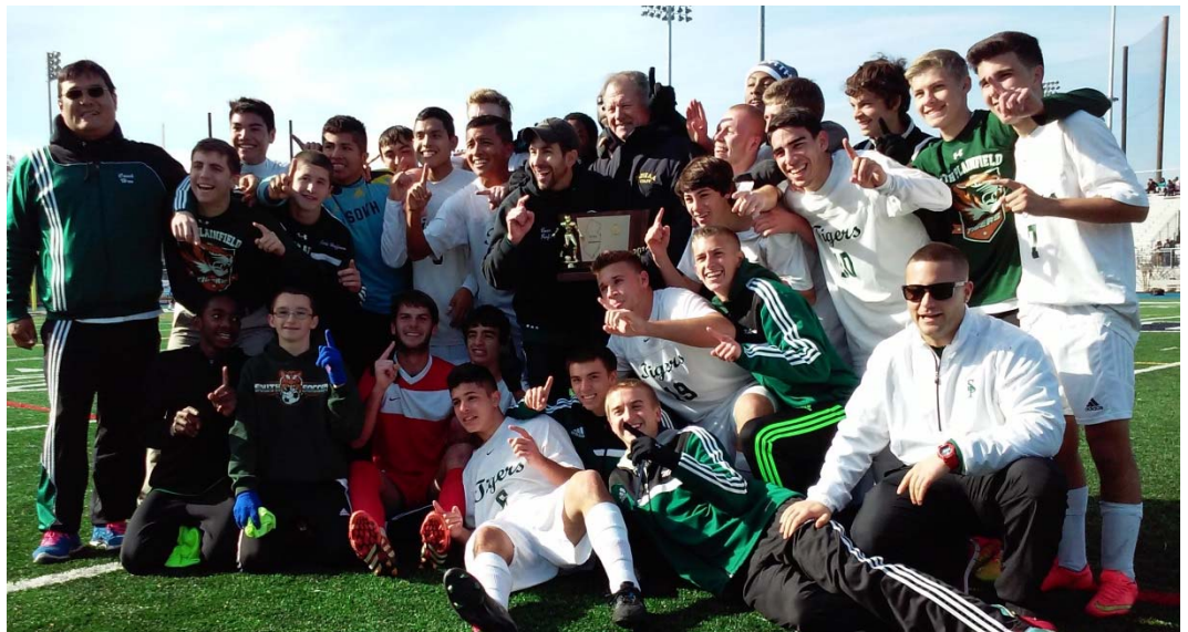
South Plainfield High School – Group III State Champions